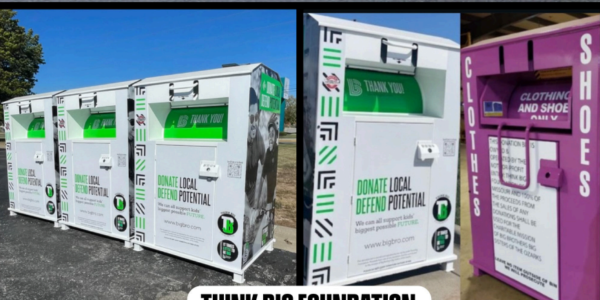
THINK BIG FOUNDATION